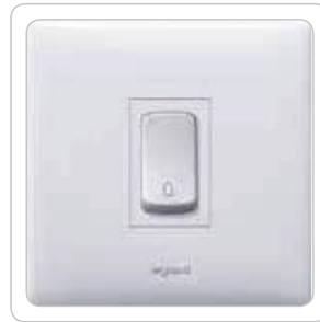
Screwless finish & rounded corners