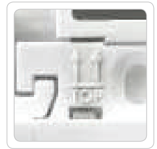
Top orientation arrow