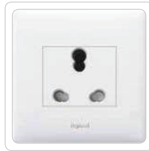
Shockproof sockets- Childsafe